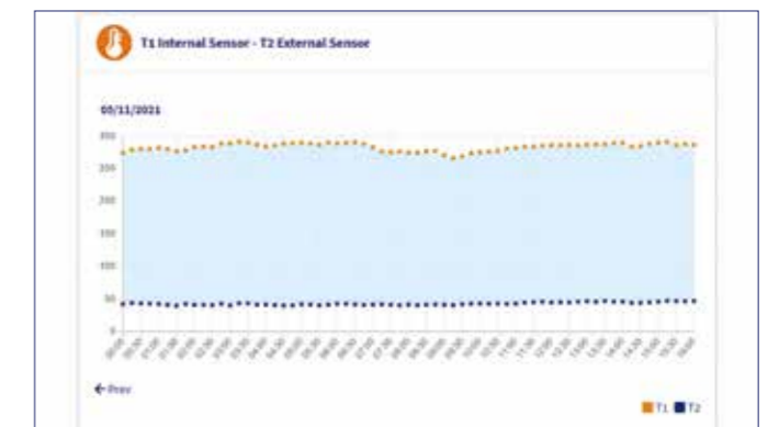
Thermal measurement: Temperature trend inside and outside the insulation